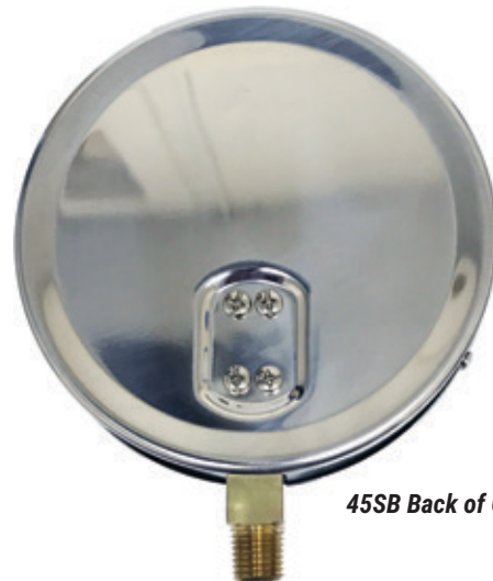
45SB Back of Gauge

Specifications subject to change without notice. Minimum order quantities may apply.