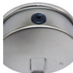
40CB Fill Top