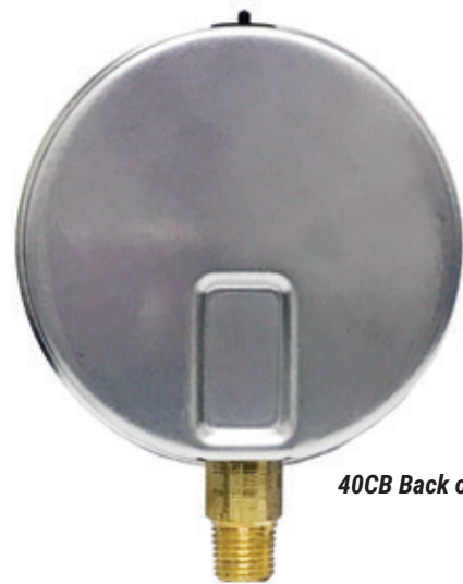
40CB Back of Gauge